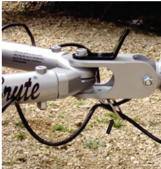
Run safety cables through chrome O ring

IMPORTANT: DO NOT TOW IF TOW BAR IS OVER 2 INCHES OFF LEVEL IN EITHER DIRECTION. IF THE TOW BAR IS MORE THAN 2 INCHES OFF LEVEL WE SUGGEST USING A DROP / OR RISER TO BRING IT TO LEVEL. MEASURE THIS WHILE ON LEVEL GROUND.